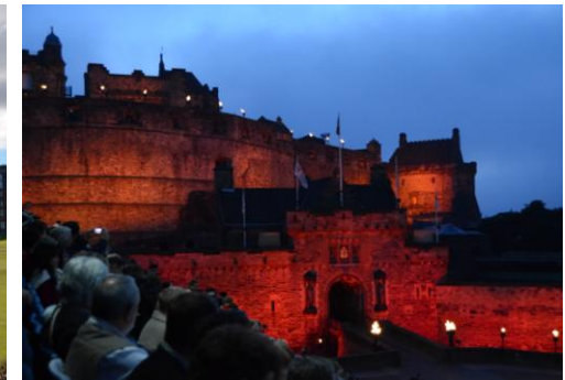
Edinburgh Castle - at the Royal Military Tattoo