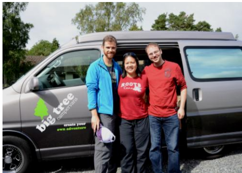
The Campervan - our home for a 6 day driving & camping tour in the highlands