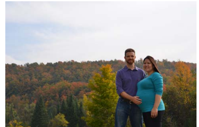
Hiking on October 2 nd at "Forks of the Credit" Provincial Park 29 weeks pregnant!