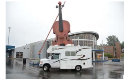
Our 20' RV & a giant fiddle Sydney, NS