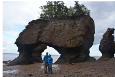
Walking the Ocean Floor at Low Tide Hopewell Rocks, NB